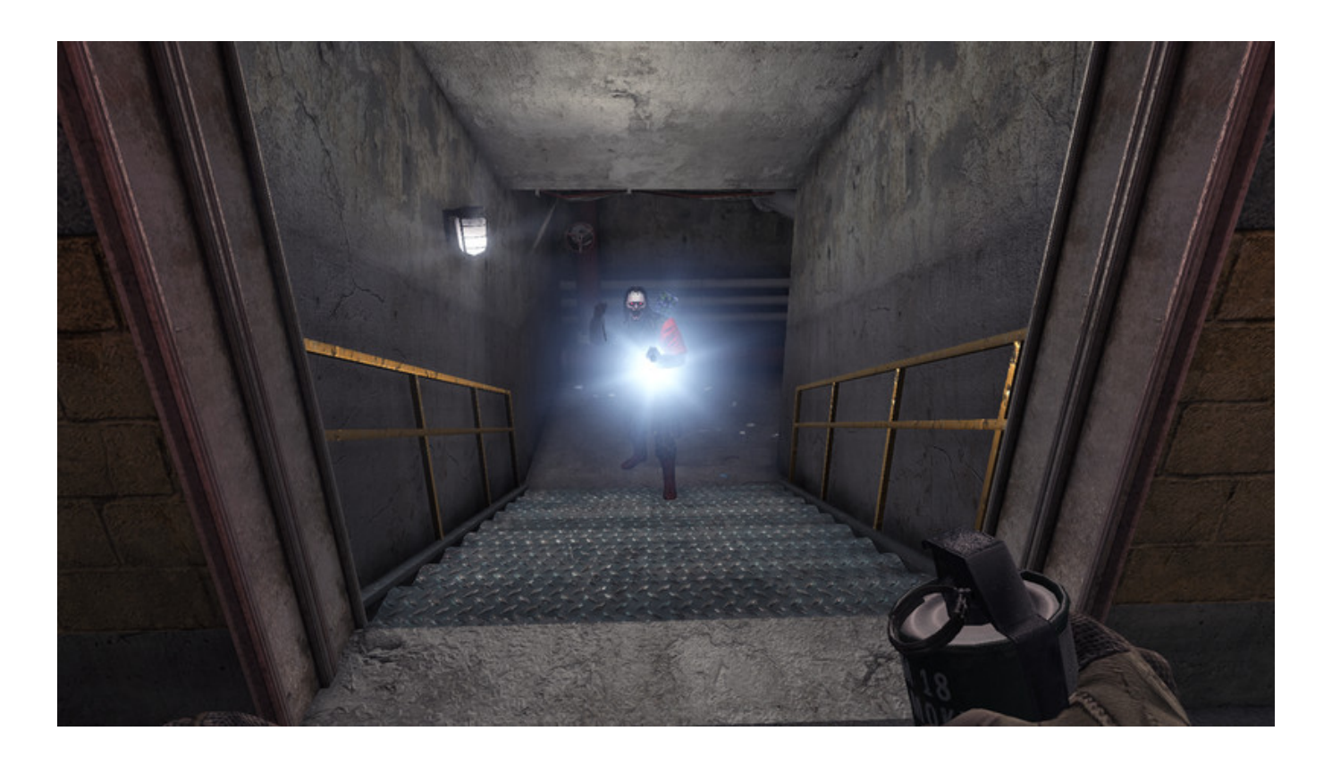
S.K.I.L.L. - Special Force 2 - Halloween Pack Download] [Ativador]